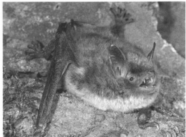
FIG. 1. Daubenton's bat, Myotis daubentonii , from the Nietoperek Bat Reserve, Gorzów voivodship, western Poland.

The skull has a smooth profile (Fig. 2), and is flat and broad, with the interorbital constriction larger than the width of the rostrum across the upper canines. The postorbital process, temporal crest, and sagittal crest are weak, and the lambdoidal crest is relatively robust laterally, but is obscure medially. The palatal emargination is shallow, as long as wide, and U-shaped. The auditory bullae are